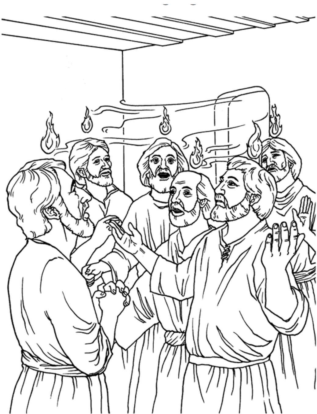
The Day of Pentecost Acts 2